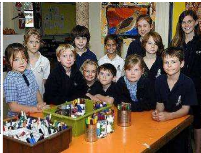
The winning poster artists